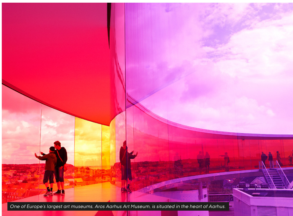
One of Europe's largest art museums, Aros Aarhus Art Museum, is situated in the heart of Aarhus.