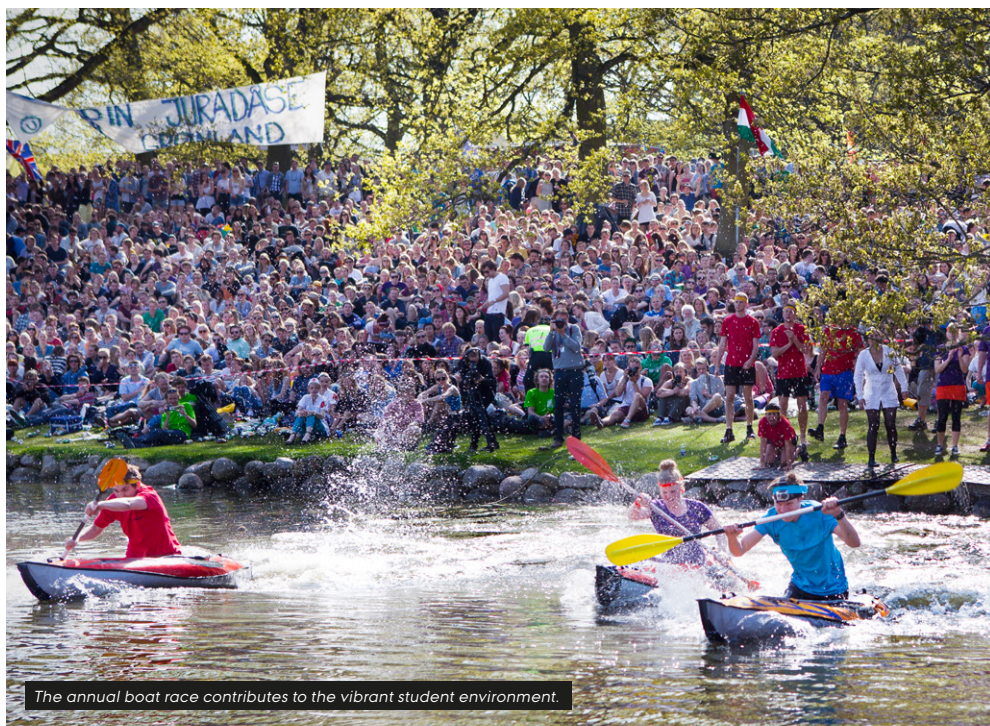
The annual boat race contributes to the vibrant student environment.