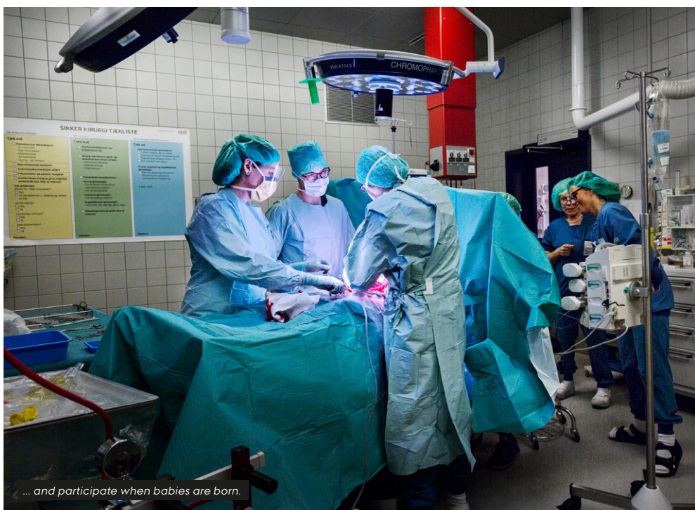
... and participate when babies are born.