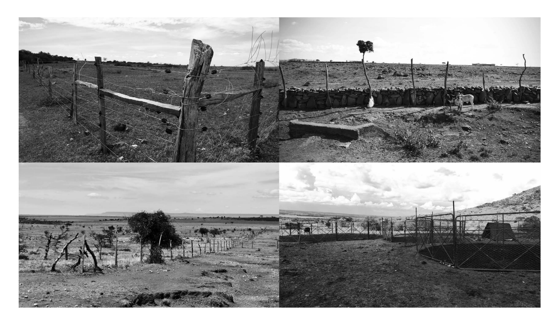
Figure 1. Examples of fences in the Greater Mara. By Mette Løvschal.

new game-proof fence to be built in 1966 that cut off and redirected a wildebeest migration with directly observable negative consequences on population size<sup>11</sup>.