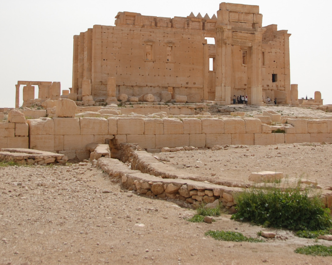
View of the Temple of Bel in Palmyra.