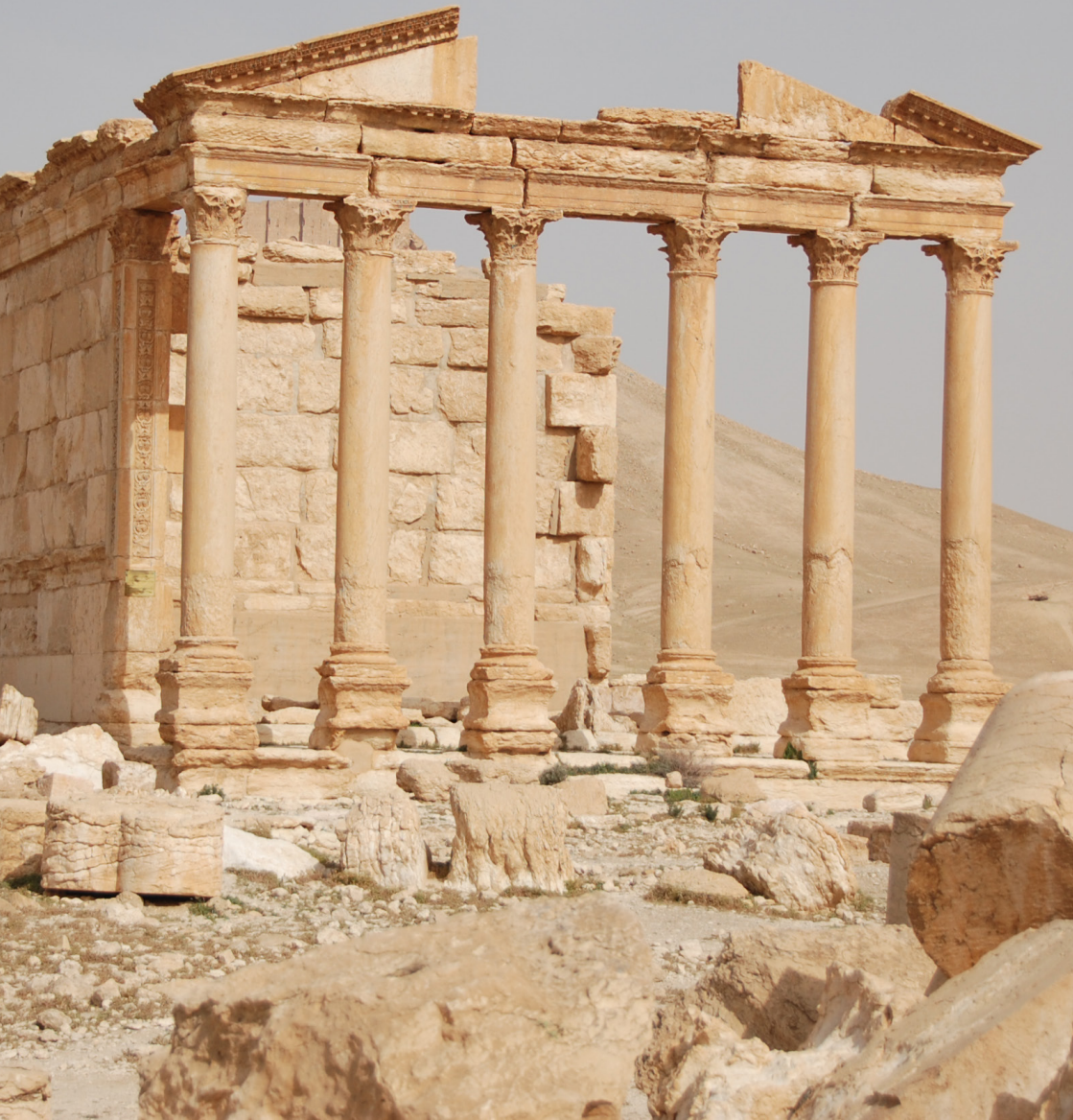
View of grave monument, a so-called temple grave, located on the main street in Palmyra.