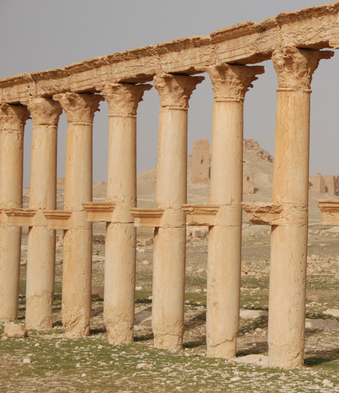
View of colonnaded street in Palmyra. The columns carry consoles for display of statues, now lost. In the background tower tombs are visible.