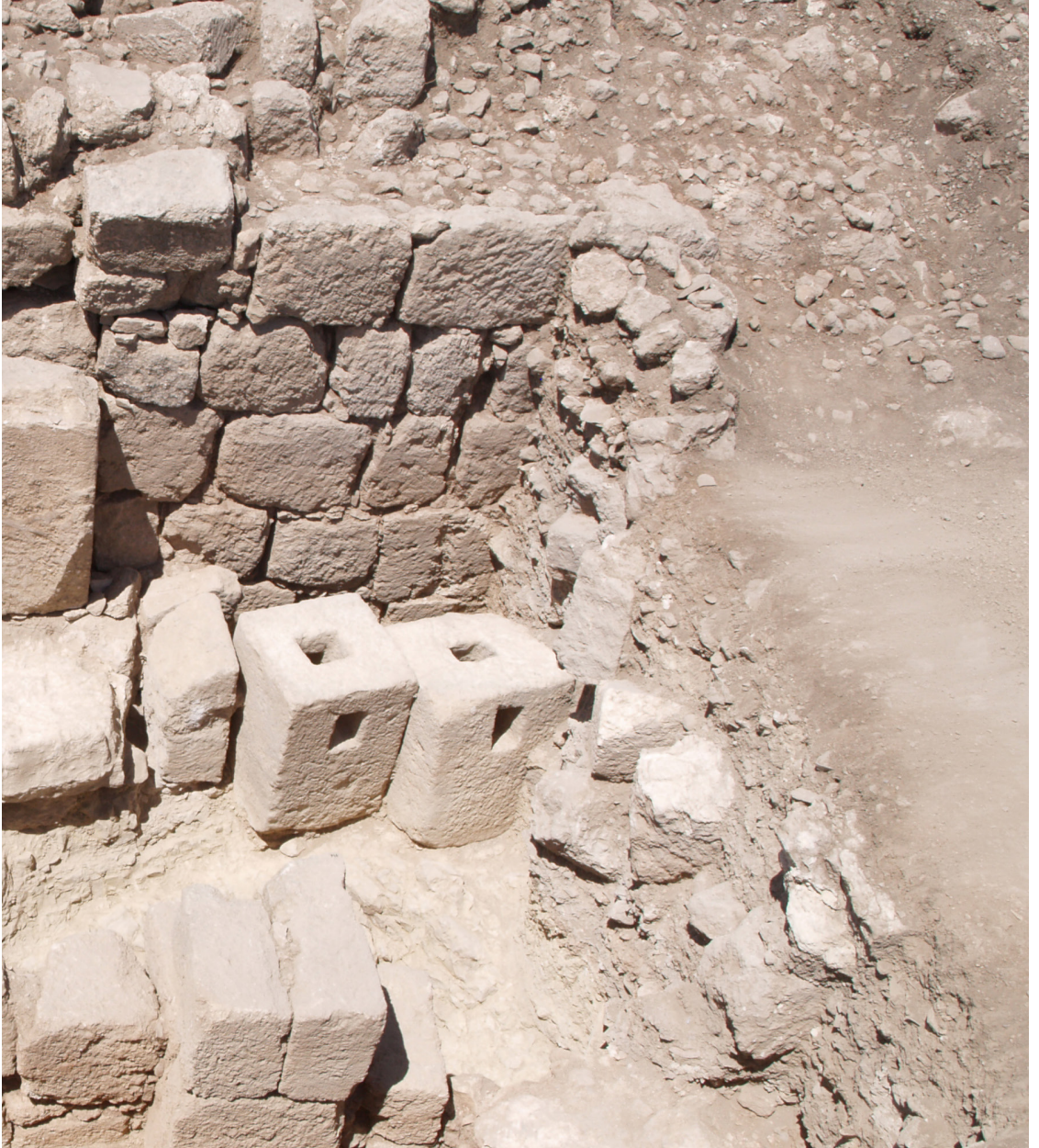
Details of oil press found in trench B in the Northwest Quarter in Gerasa.